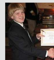
A young 2011 Scholarship recipient accepts his award.

The Suffolk Chapter of the AGO is a 501(c)3 not-for-profit educational organization, as registered with the Internal Revenue Service. All contributions are tax-deductible for Federal income tax purposes.