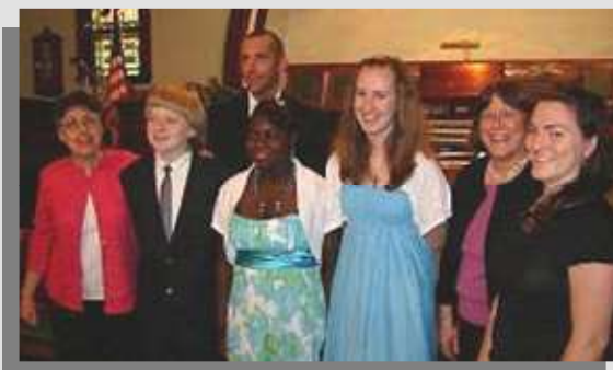
Award recipients and presenters at the 2011 Scholarship Awards Recital at the First Congregational Church in Riverhead, NY.

For scholarship recipients under the age of 17, we will require a Statement of Commitment signed by student, parent, and organ instructor.